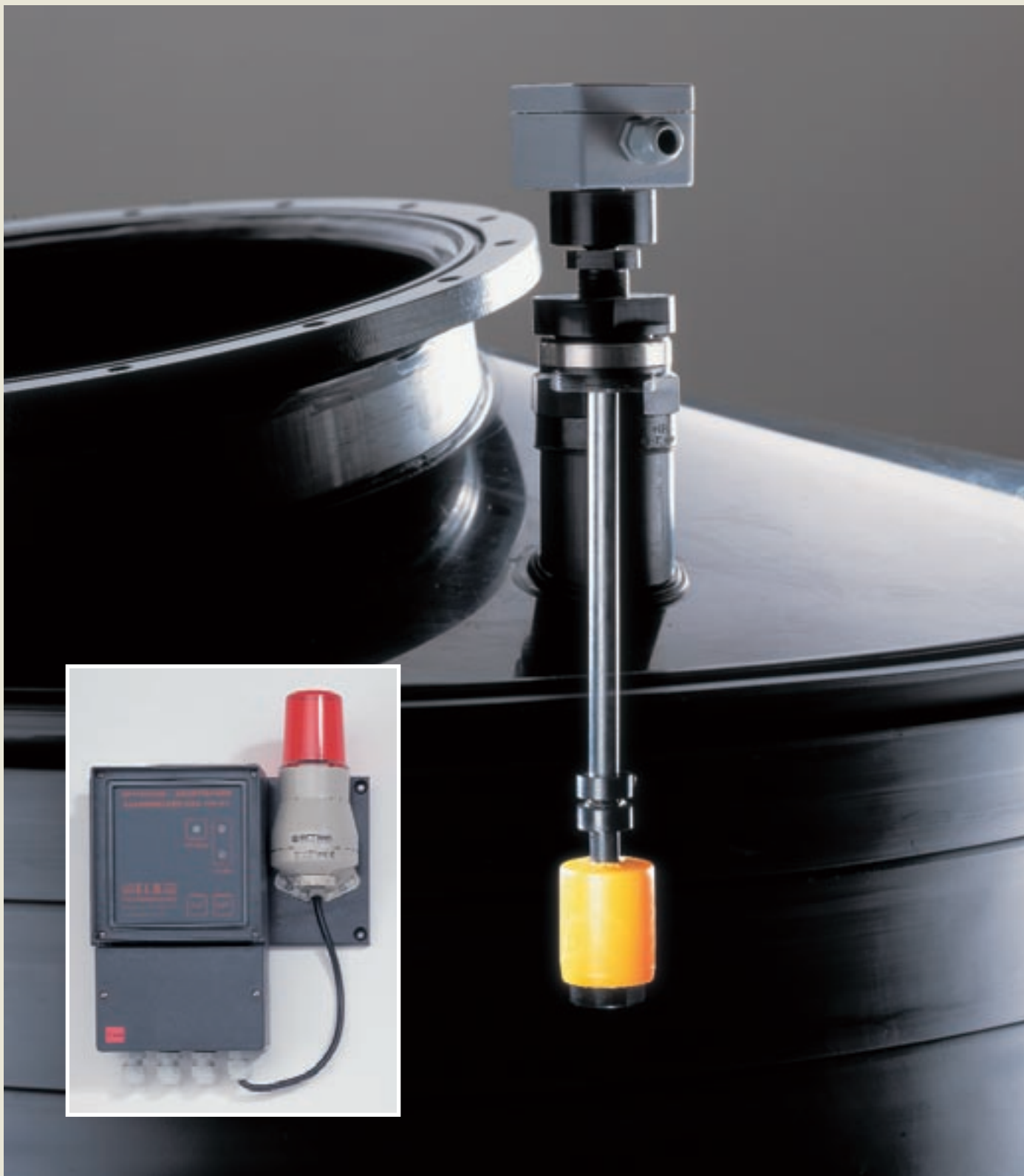
Liquid level limit switch with note of approval

To protect all types of storage tanks by alarm or automatic filling stop