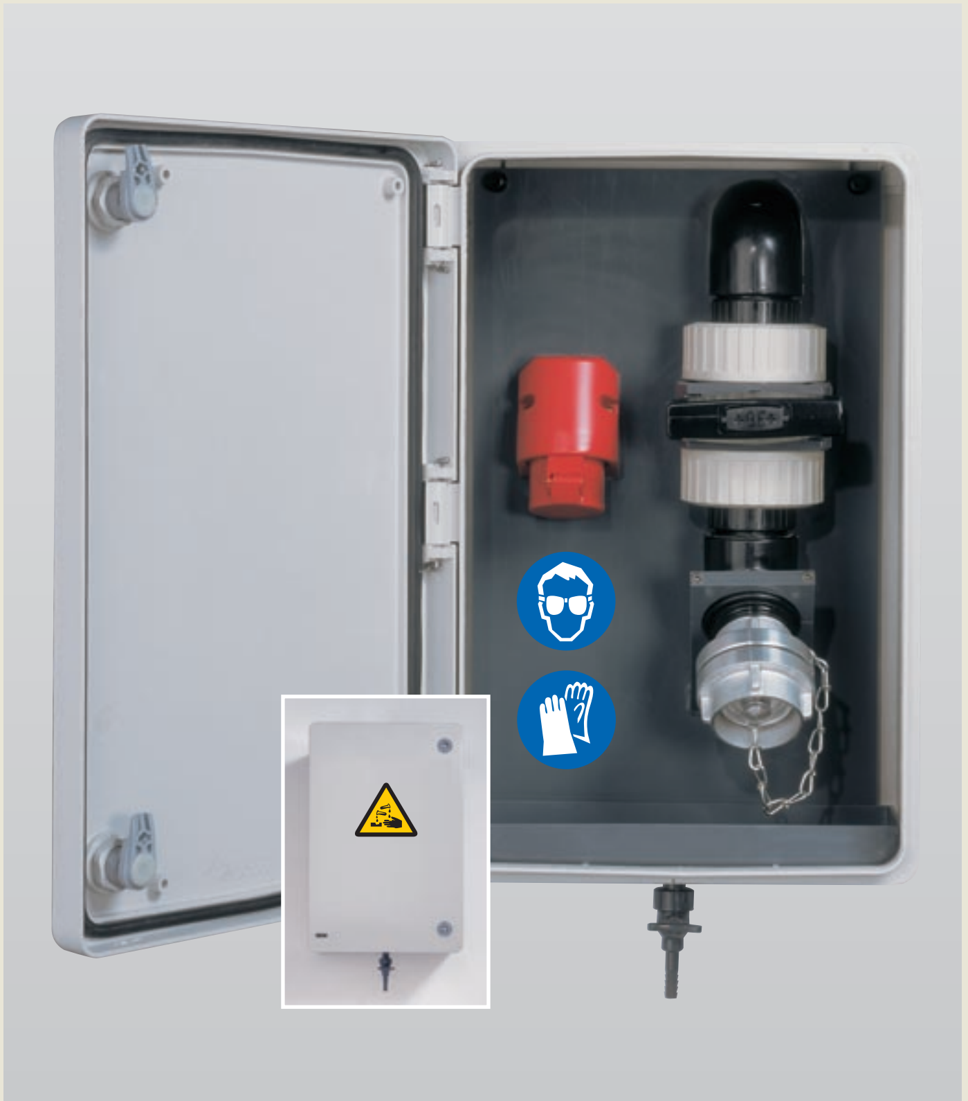
Filling Connection Cabinet

to prevent false filling and to secure filling lines